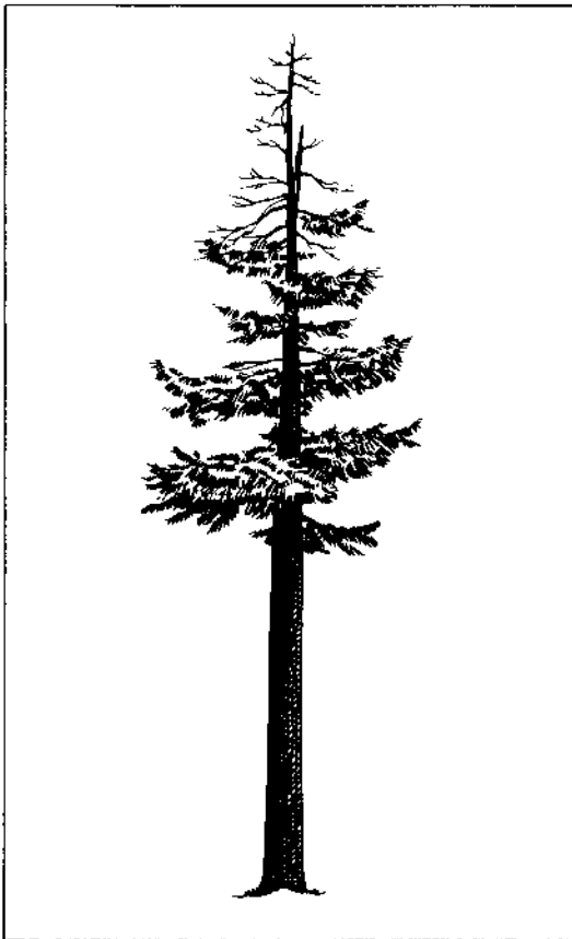
Snag Type 3 - Live defective trees that are safe for topping to reduce susceptibility to blowdown after harvest.