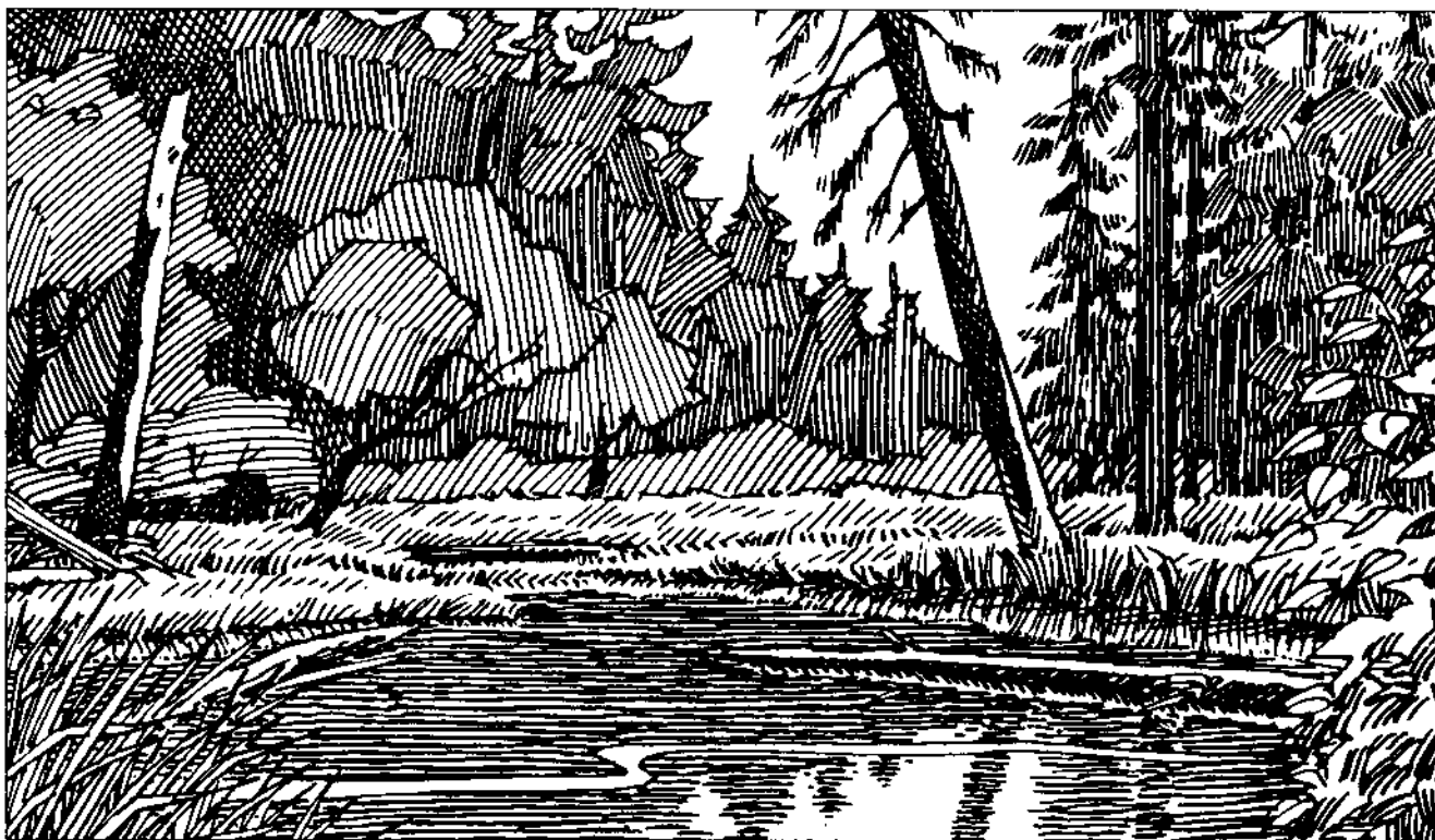
Wildlife trees can be left along lakes, ponds or streams, especially where the lean is over water or along the edge away from work area.

Cavity trees can be a hazard to vehicles, buildings, powerlines, fences and workers if not