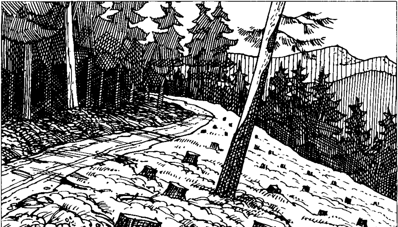
Wildlife trees may be left where they will cause little problem if they fall, such as along roads so they do not threaten to roll, fall or slide into the right-of-way.

The most productive cavity habitat will be present when a variety of trees species, diameters and heights are available throughout the woodlot. Conifers usually last longer than other species. In general, cavity trees less than 12 inches in diameter and less than 15 feet high provide the least amount of benefits. Also your woodlot should have a minimum of two pieces of large, downed woody material per acre in various stages of decay. These pieces should be 10 feet long to be